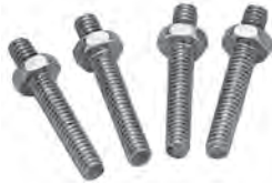
STOCK NO. 2087A MOUNTING STUDS 10-32 X 1" 4 per set (available separately)