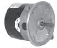
EL2004 Reversible Switch Model Oil Burner Motor