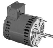
FIG. C D1170