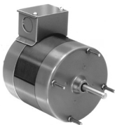
FIG. F D113, D114, D115