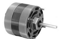
FIG. E D174