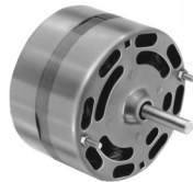
FIG. B D170, D116, D118, D377, D310, D674, D374