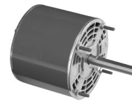
FIG. D D119