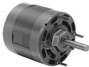
FIG. A D1061

NOTES: 68: Used in Jenn Air units. P/N 7108-2101 69: Used in Leslie Locke ventilators original P/N 7108-5056 178: External oil retainer to accommodate resilient rings and cradle base, drilled and tapped holes in case for mounting in Coleman applications. (2 holes each end on case OD). 179: Self cooled for mechanical duty