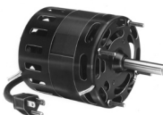
FIG. F D1039