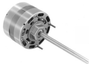
FIG. B D117