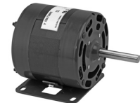
FIG. E D1006